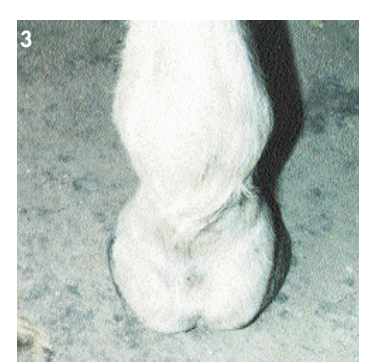
Photos 1,2,3: It has been 7 weeks since the last shoeing. The foot runs forward and carries a medial toe flare.