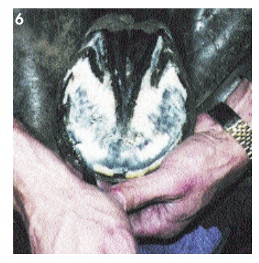
Photo 6: Prep the sole. You want it to be smooth and not weakened by over-paring. Bars should be solid and the sole should not give to thumb pressure.