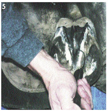
Photo 5: Paring the frog, keep it neat and smooth. Keeping the knife straight up allows you to establish a solid frog.