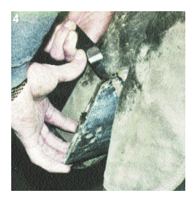
Photo 4: Clean bulb and heel area. Start to establish the widest portion of the frog using the angle of the heel.