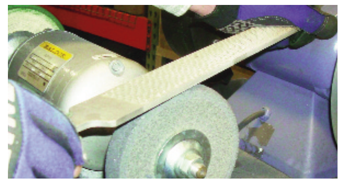
ABOVE: CONTINUE WITH PROCESS UNTIL WHEEL IS EVEN AND DAM-AGED AREA IS TAKEN OUT.