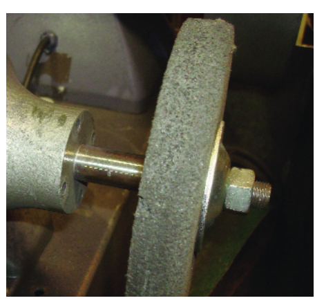
LEFT: SHARPENING WHEEL HAS DAMAGE AND UNEVEN WEAR.