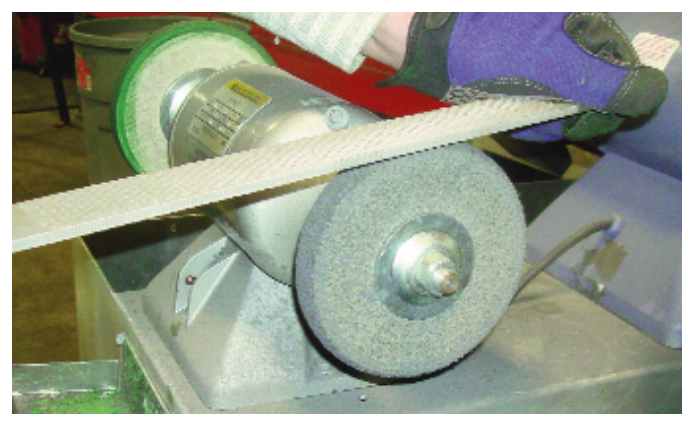
ABOVE: BEGIN MOTION ACROSS WHEEL.