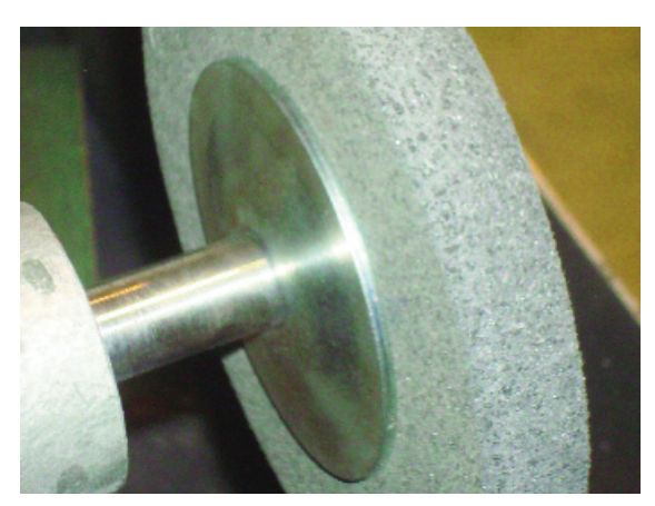
ABOVE: WHEEL RESTORED TO GOOD WORKING CONDITION.