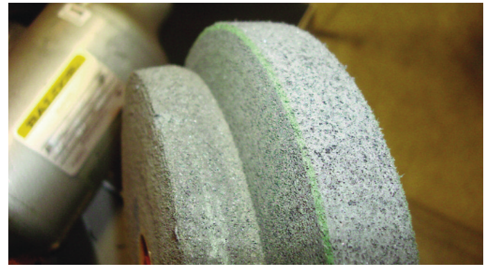
ABOVE: COMPARE DAMAGE AND WEAR TO NEWER WHEEL