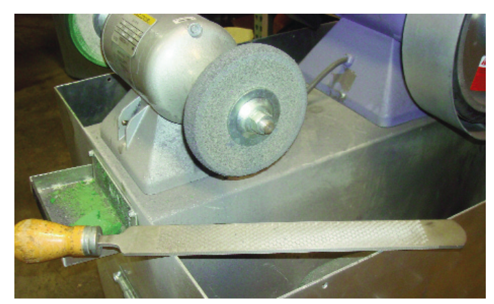
ABOVE: AN OLD RASP IS THE ONLY TOOL NEEDED. (Photos Continue on Next page)