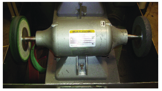
ABOVE: 1/4HP BUFFER WITH SHARPENING WHEEL ON RIGHT AND FELT WHEEL ON LEFT.

Once you have restored a level, round finish, you can bevel the edge or edges if this works for your use of the wheel.