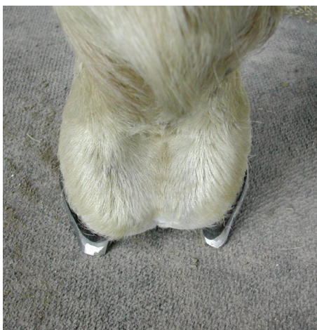
Nice view looking down the limb to see the support the modification can give.