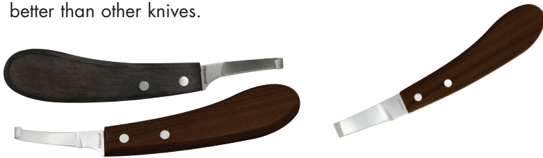
Diamond Narrow Blade Left and Right

Diamond® has introduced a redesigned hoof knife. Developed with the horse owner and farrier in mind, the new hoof knives feature sharper stainless steel blades that hold their edge much better than other knives.