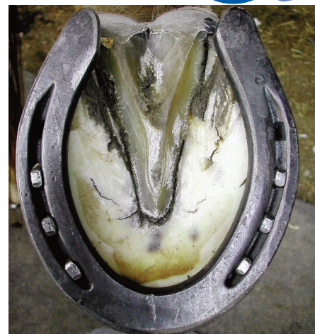
Lateral heel fit a bit wider for this horse, medial tighter to avoid interference potential.