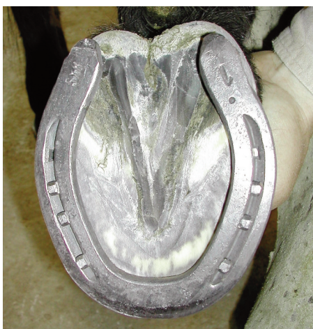
Bottom of foot, SX-8 unclipped shoe.