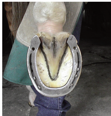
This SX-8 clipped shoe on a jumper is a slightly different look but can be considered an extended heel.