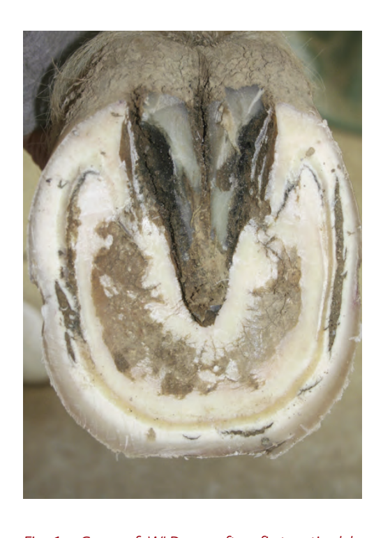
Fig. 1 - Cases of WLD are often first noticed by farriers during routine trimming/shoeing visits. An area of separation in the hoof wall that is filled with dirt/debris is noted.

Many cases of WLD are treated/managed by farriers during routine visits. Farriers should be encouraged to debride small areas of separation to a healthy margin whenever possible. If areas of separation are to be covered by a horse