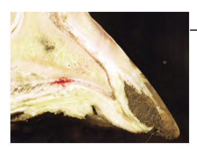
Fig. 3. - Lameness is usually only noted when extensive separation has occurred, resulting in an instability of the distal phalanx within the hoof capsule