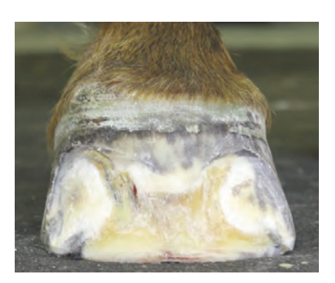
Fig. 8, 9, 10 - A sequence of debridement prior to topical treatment.