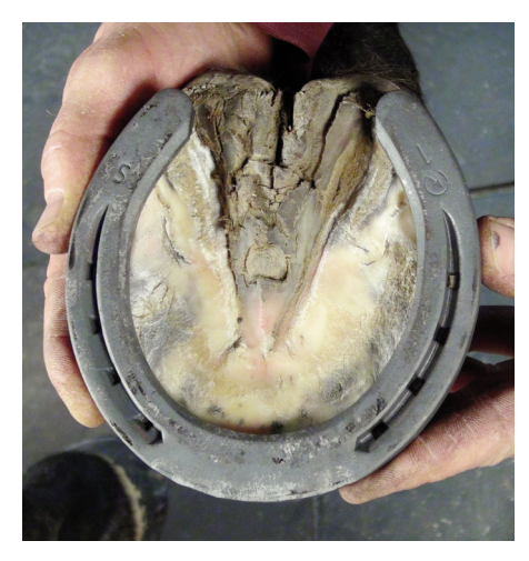
View at foot before modifications- note the condition of the frog, still to be dealt with.

View this article on FPD's Field Guide for Farriers » www.farrierproducts.com/fieldguide/western