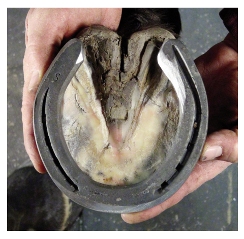
Final modification was to bevel the toe and the shoe is ready to go on. Note the bevel is greater at the point of breakover, not always the center of the toe. Frog will be cleaned up and get an application of SBS Thrush Stop Blue.