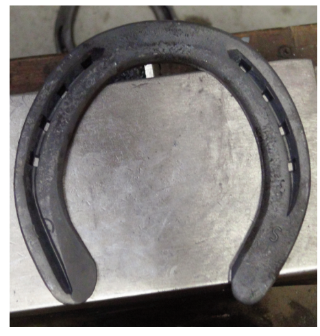
His second step was to forge the inside web of the lateral heel to be sure he had good foot coverage.