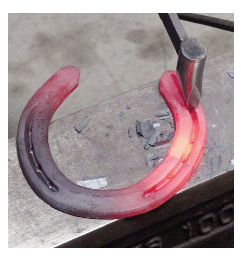
Using a Bloom steel handled creaser, Mike widens the lateral heel.