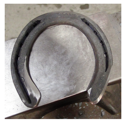
Wider lateral & narrower medial modifications set to go.