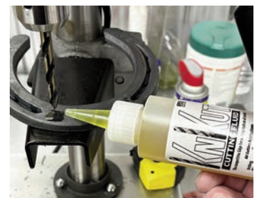
Cutting Fluid applied before drilling

Once you've drilled the stud hole, carefully position your stud before striking to be sure it is going in straight. Make one light blow to get it started correctly and then drive to the desired depth. It's important not to “bottom out” a stud on the anvil, something that usually would not occur except when using thinner shoes that are 1/4” or 7mm.