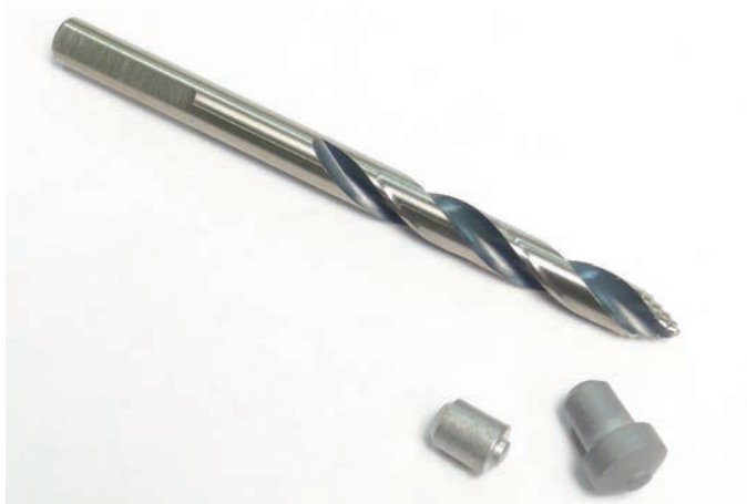
KnKut 17/64” Step Point Drill Bit

Solid carbide studs are very precise and hard throughout. It's important to use exactly the right drill bit size and one of a high quality to get an optimum fit. The studs are tapered so that they tighten as they are driven into the hole but require a 17/64” hole to fit correctly. A 17/64” bit is the only correct size. You may find bits in places like Home Depot or Lowes that indicate they are 17/64” but may also have a metric size shown like 6.8mm. It's very likely that the bit manufacturer is trying to accommodate various markets and the bits marked in this way may not be a precise 17/64” size and you could end up with a hole that is oversized or even undersized in some cases. Buy bits that are consistently correct. The higher the quality, the better the bit will perform and last before dulling. A dull bit will end up creating inconsistent holes.